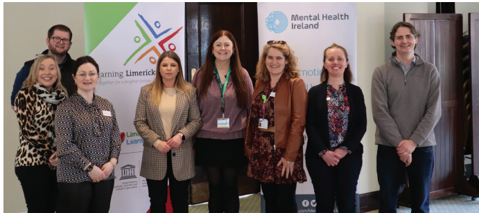
Some of the Members of the Festival Organising Committee

So, whether you might like to discover more about the Origins of Chocolate, or are you are curious about the Benefits of Introducing Books to Babies, or perhaps an Interactive Woodturning Session is more your cup of tea, Limerick Lifelong Learning Festival 2022 has got you covered. Visit our website and social media for Event listings and updates. What are you waiting for? Are you ready to take on the learning challenge and 'Learn Something New in 2022?'