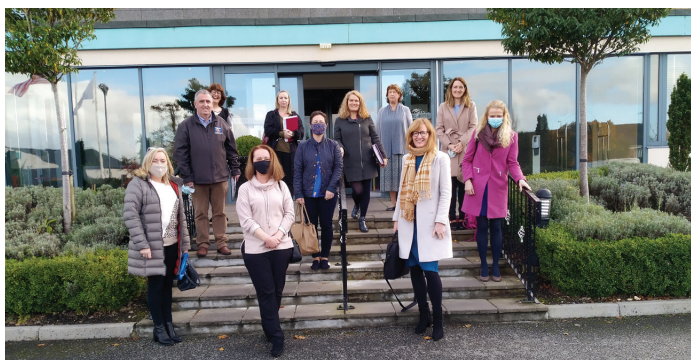
Steering Group Planning Session